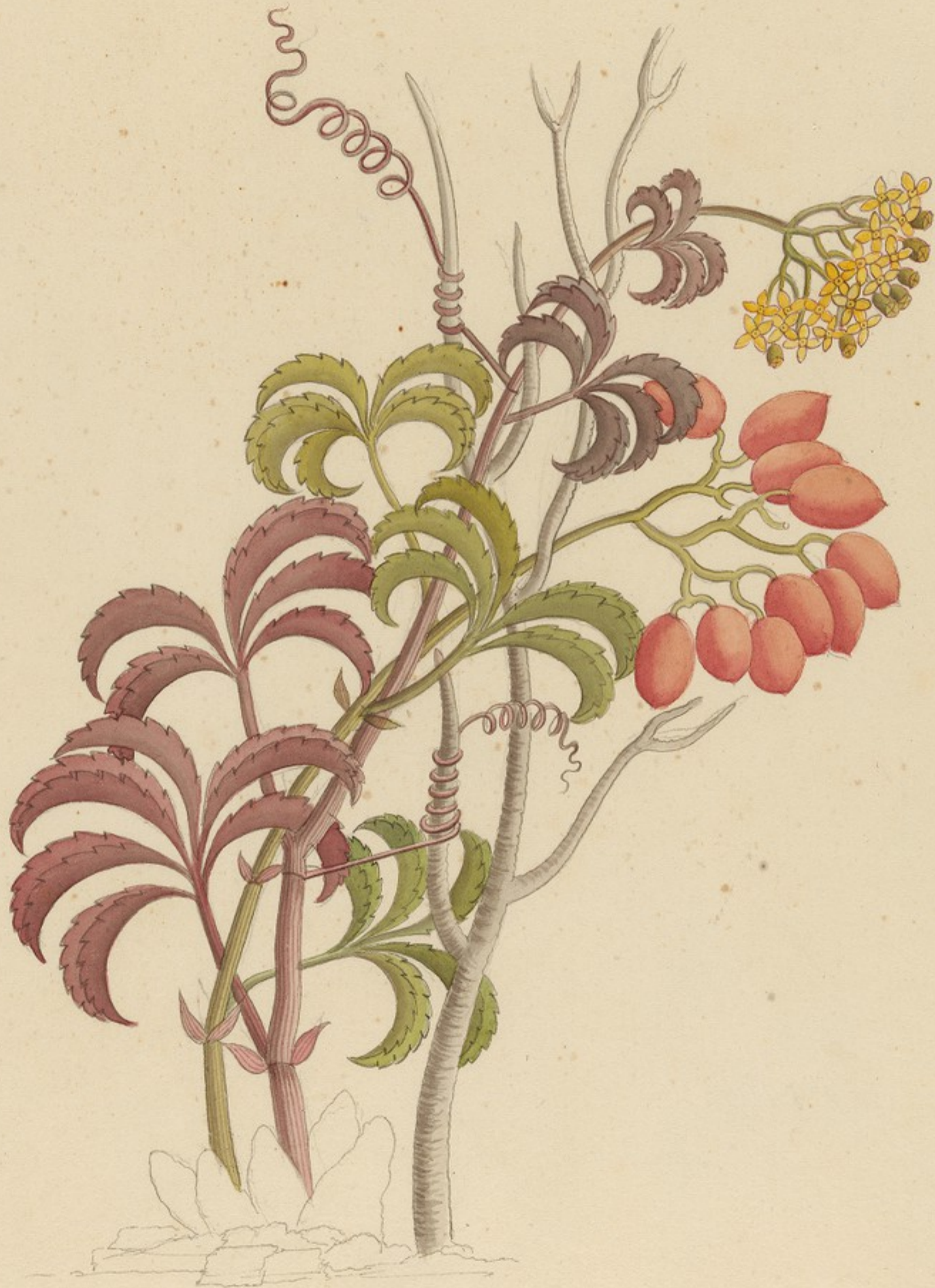
Cissus Nov. Sp.