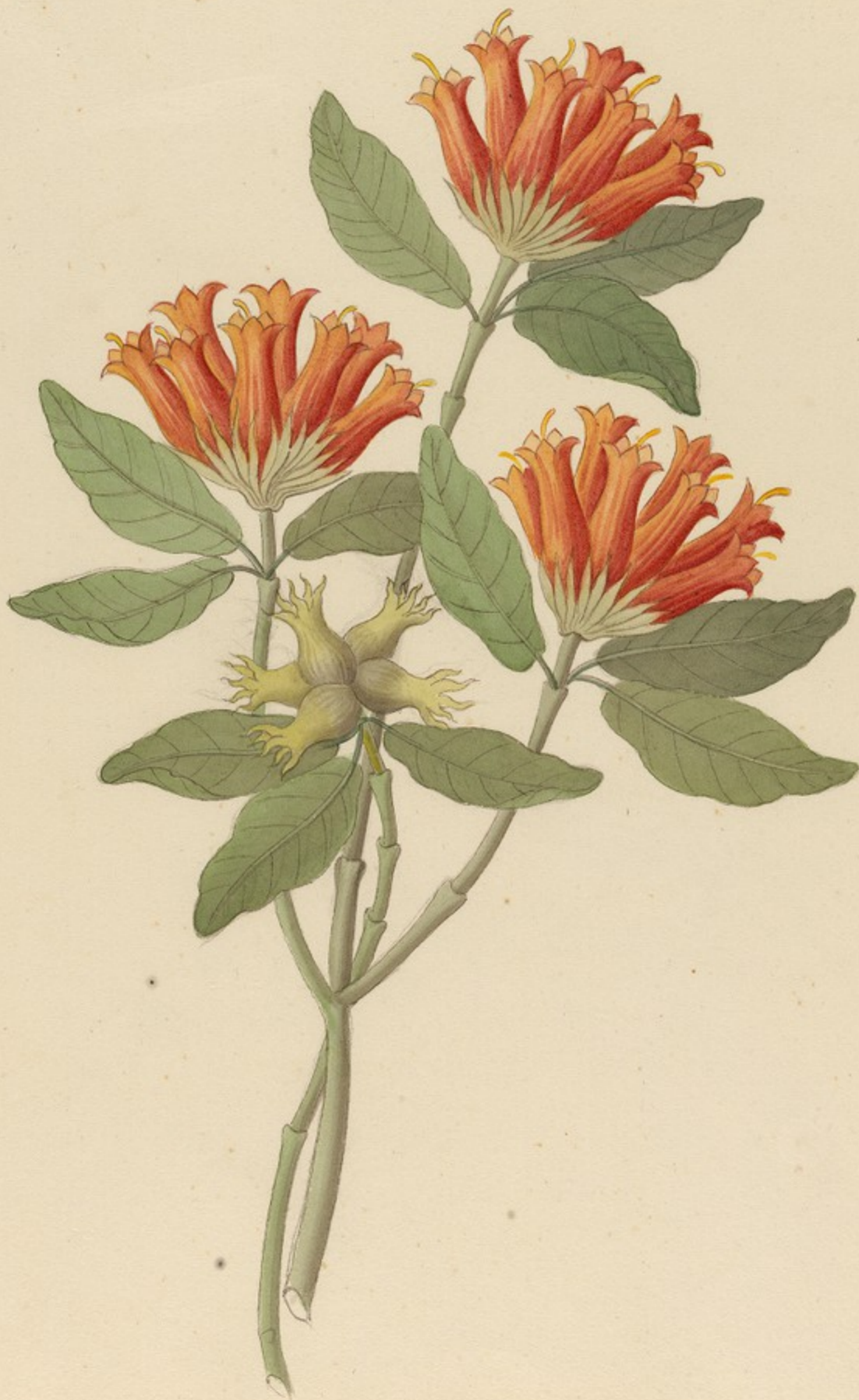
Gardenia Nova sp