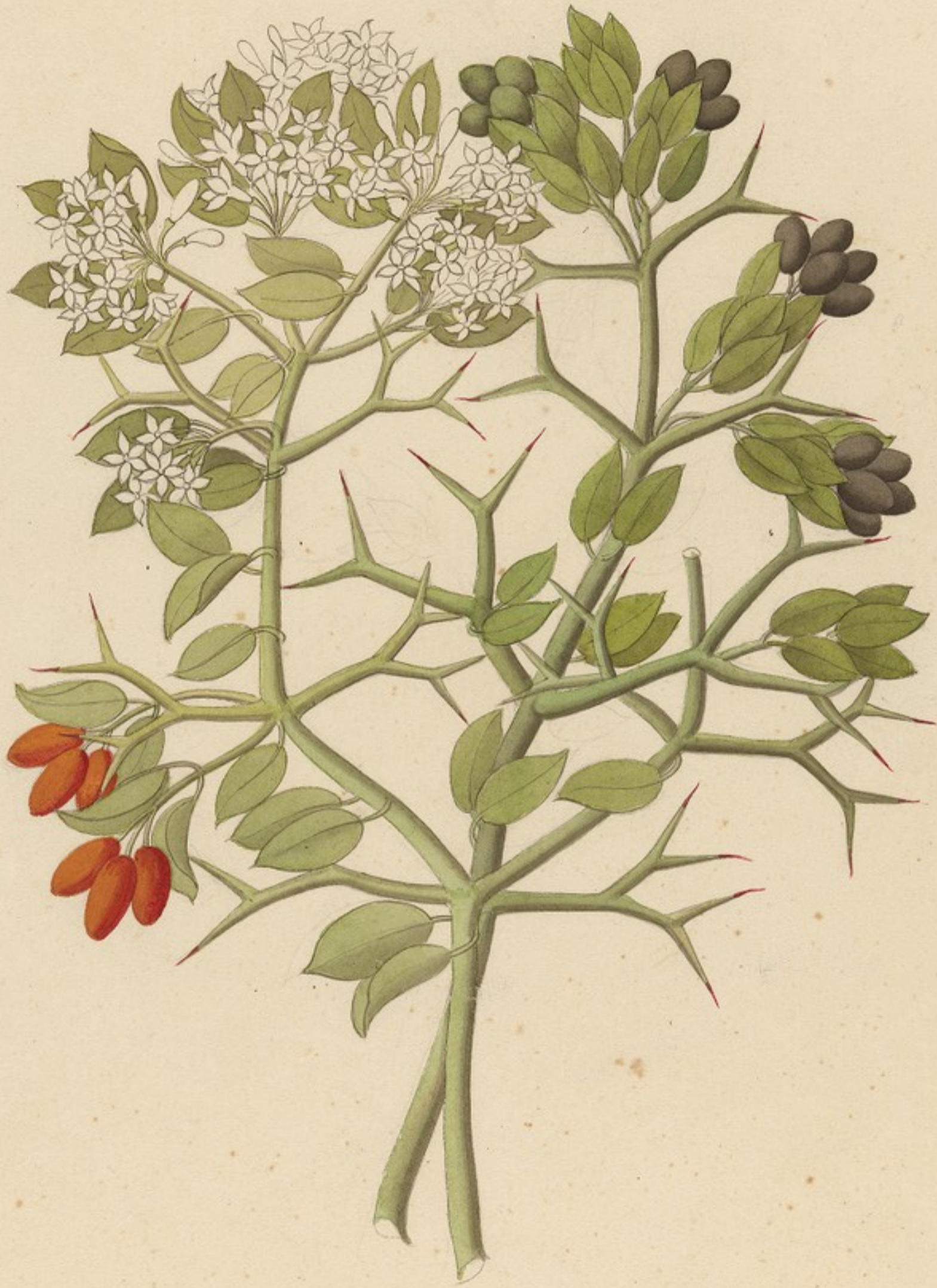
2. Species Carissa Arduina?