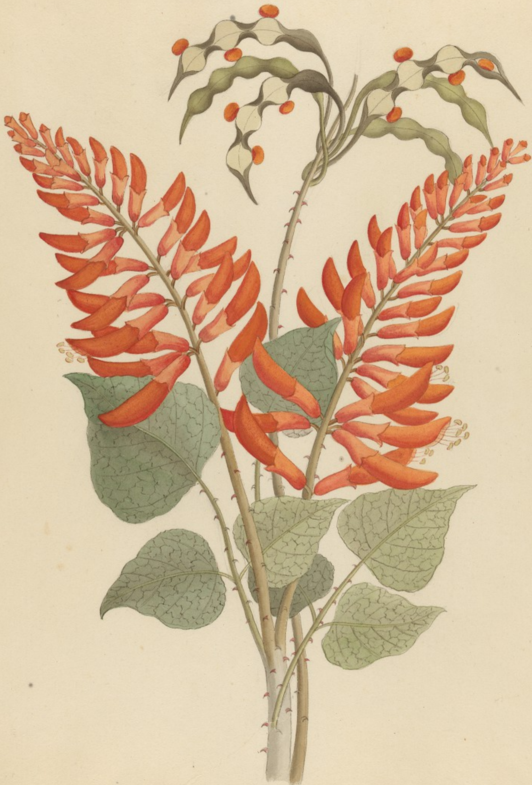
Erythrina, nov. Specie.