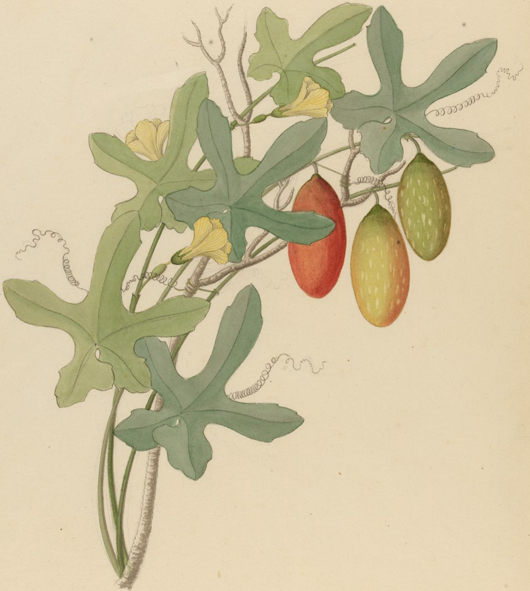
Cucumis Melitroica pendula?