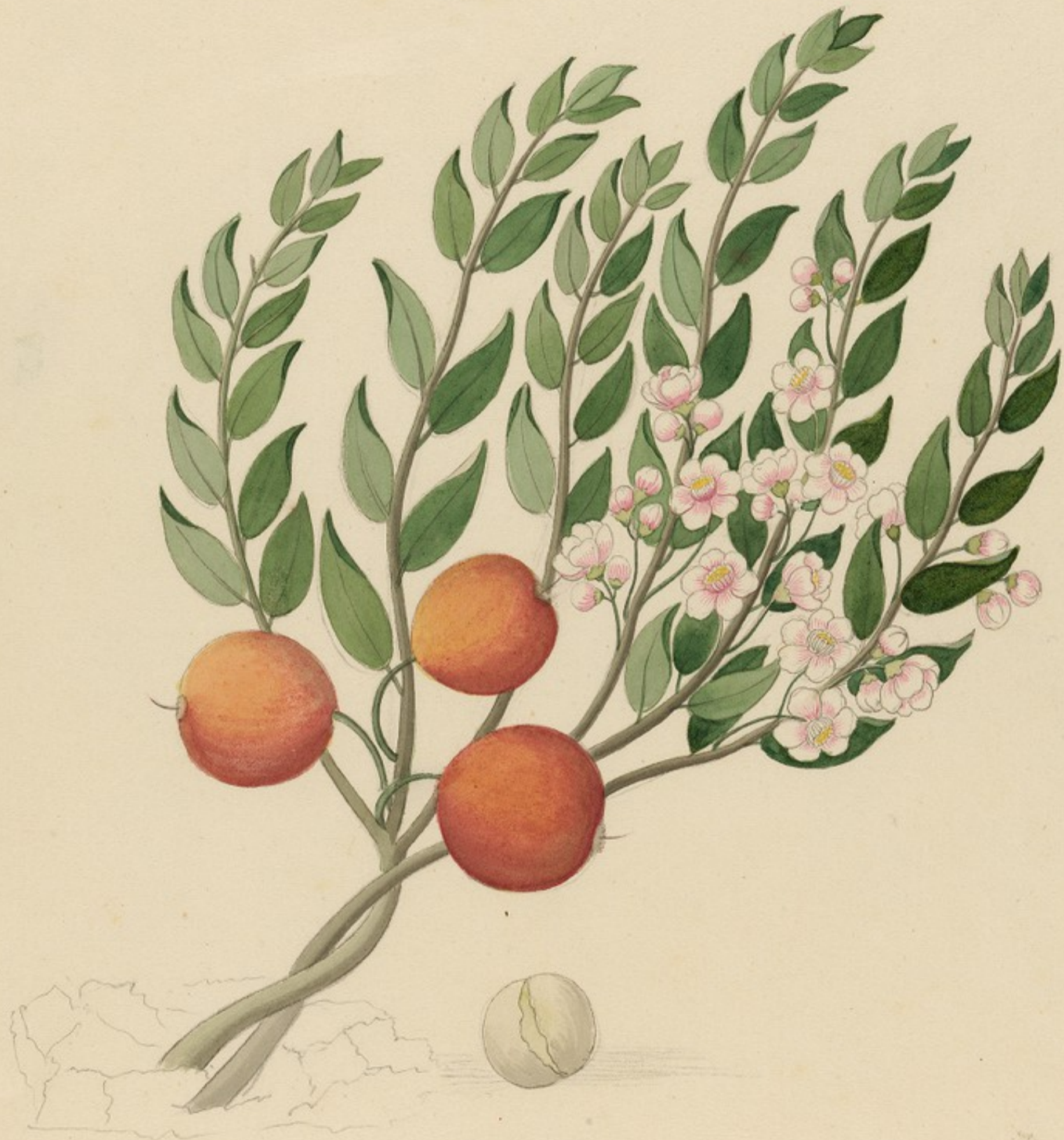
Eugenia - or Jambos