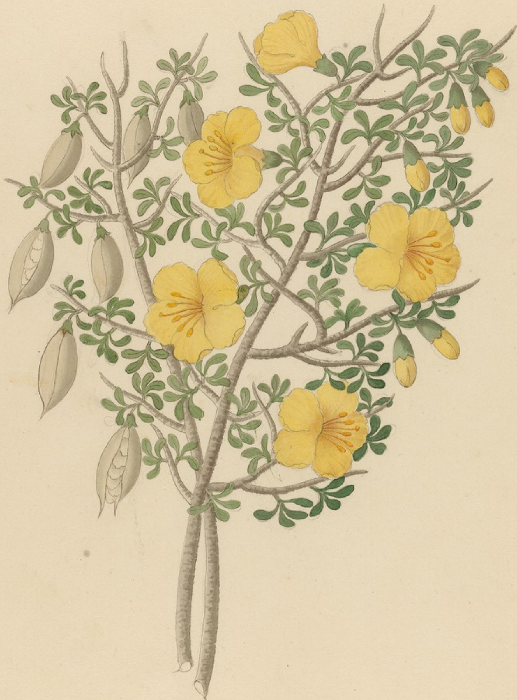
Bignoniaceae Nova Species.