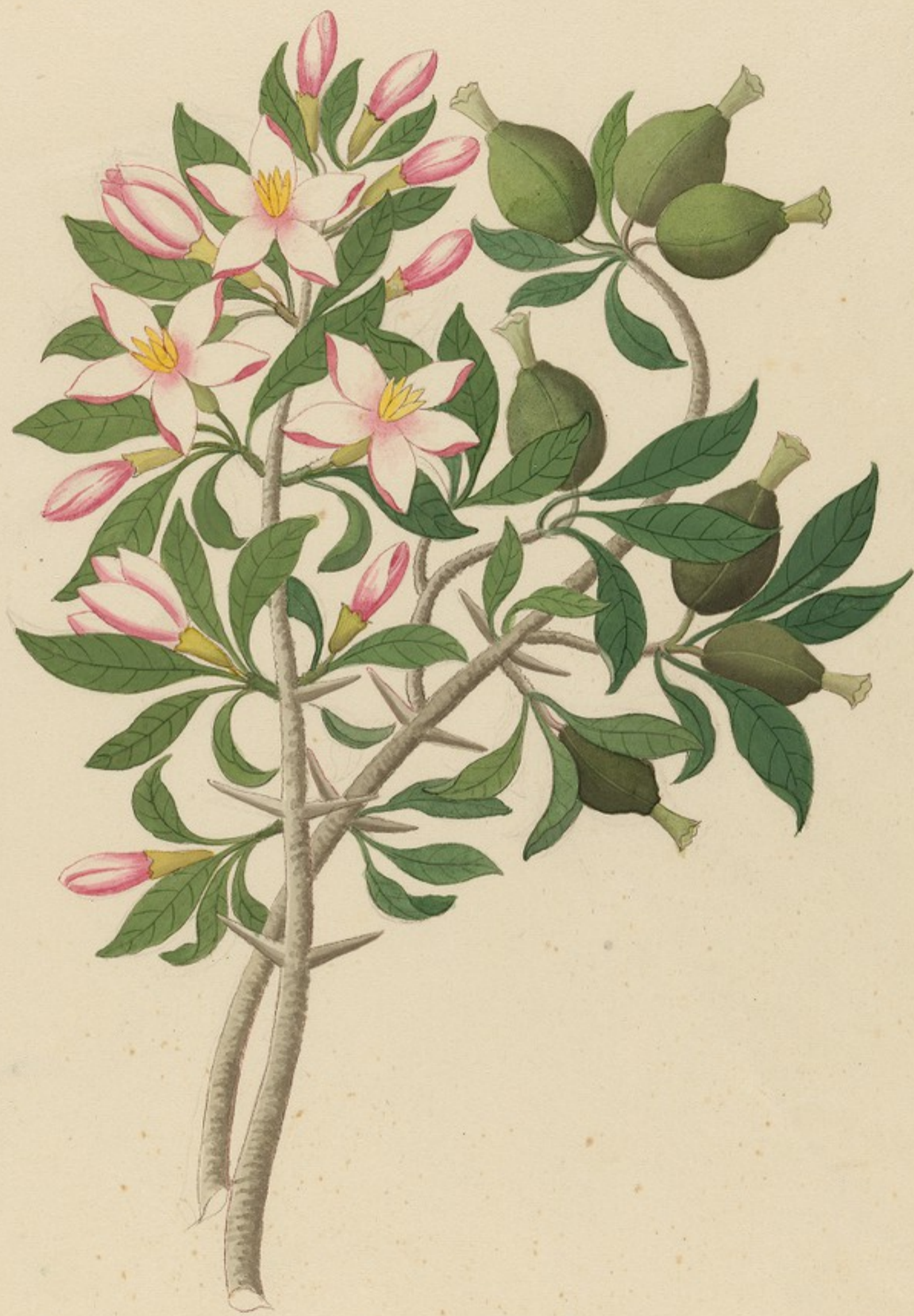
Gardenia, Nov. Sp.