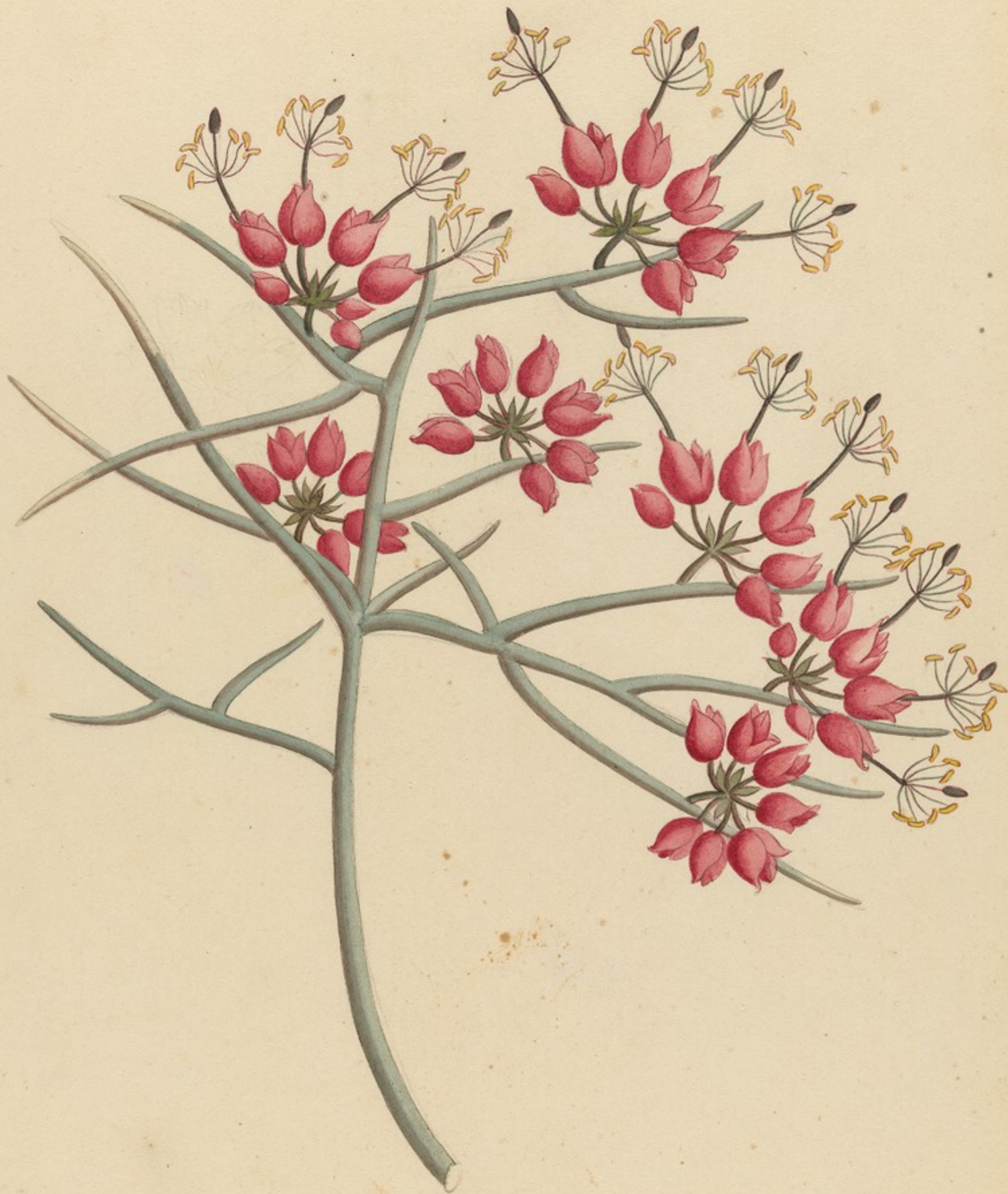
Cleome juncea Trädelskivia, or monadelphica ?